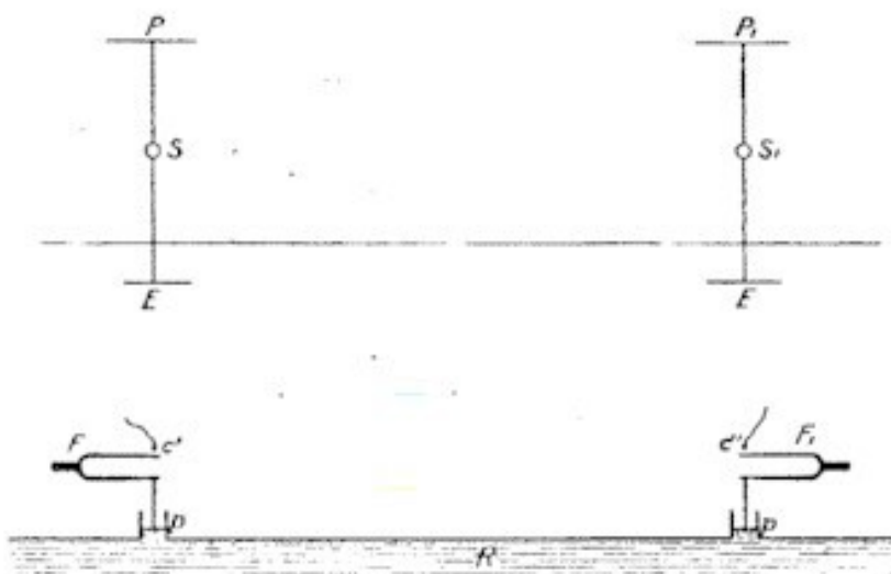
DIAGRAM c. "WIRELESS" TELEGRAPHY MECHANICALLY ILLUSTRATED.

The electrical system illustrated in the upper figure of diagram c is exactly the same in principle, the two wires or circuits ESP and E_1S_1P_1 , which extend vertically to a height, representing the two tuning-forks with the pistons attached to them. These circuits are connected with the ground by plates E, E_1 , and to two elevated metal sheets P, P_1 , which store electricity and thus magnify considerably the effect. The closed reservoir R , with elastic walls, is in this case replaced by the earth, and the fluid by electricity. Both of these circuits are "tuned" and operate just like the two tuning-forks. Instead of striking the fork F at the sending-station, electrical oscillations are produced in the vertical sending- or transmitting-wire ESP , as by the action of a source S , included in this wire, which spread through the ground and reach the distant vertical receiving-wire E_1S_1P_1 , exciting corresponding electrical oscillations in the same. In the latter wire or circuit is included a sensitive device or receiver S_1 , which is thus set in action and made to operate a relay or other appliance. Each station is, of course, provided both with a source of electrical