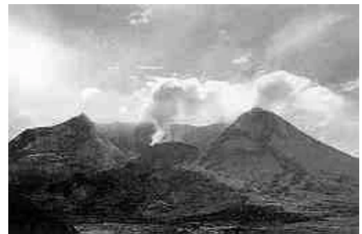
Figure 1. The newest lava dome within the horseshoe-shaped crater at Mount St Helens during its building process in August 1984.

October), near-surface magma had low enough steam pressures so that viscous lava flows formed three consecutive, dome-shaped structures within the crater. The first two dacite lava domes built within the crater (late June and early August 1980) were destroyed by subsequent explosive eruptions (22 July and 17 October). The third dacite lava dome began to appear on 18 October 1980 above the lip of a 25-metre-diameter feeding conduit.