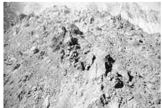
Figure 3. Blocky surface texture of the east side of the dacite lava dome above prominent talus slope (helicopter photo by S.A. Austin, October 1989).

Geologists are in general agreement concerning the crustal source of the dacitic magma beneath Mount St Helens. Experimental data from the assemblage of minerals in the dacite indicate that just prior to the 18 May 1980 eruption the upper part of the magma chamber was at a temperature of 930°C and at a depth of about 7.2 km. 13 That magma is believed to have contained about 4.6 weight% total volatiles, mostly H 2 O. 14 The last dome-building intrusion event