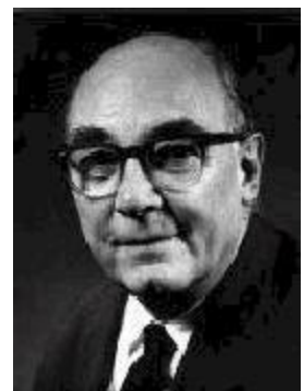
Carl David Anderson 1905 - 1991

Analogous processes have been known to occur in crystals of sodium chloride ( NaCl , table salt) and in similar ionic crystals. The NaCl crystal consists of positive sodium ions ( Na + ) and of negative chlorine ions ( Cl - ). Their charges are equal to those of the positron and of the electron, and neutralize each other in the crystal. The binding energy per ion pair is 8eV , thrice the energy of a quantum of blue light. Hence, in the pure crystal, there is no absorption of visible light, nor of the ultraviolet of our environment. There are thus no free ions, the motion of which in an applied electric field would result in measurable conduction currents. The pure crystal is highly transparent and, as an electric insulator, it is probably the best after the best achievable vacuum space.